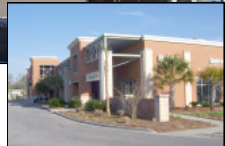
Endcap Unit Direct Hwy. Exposure